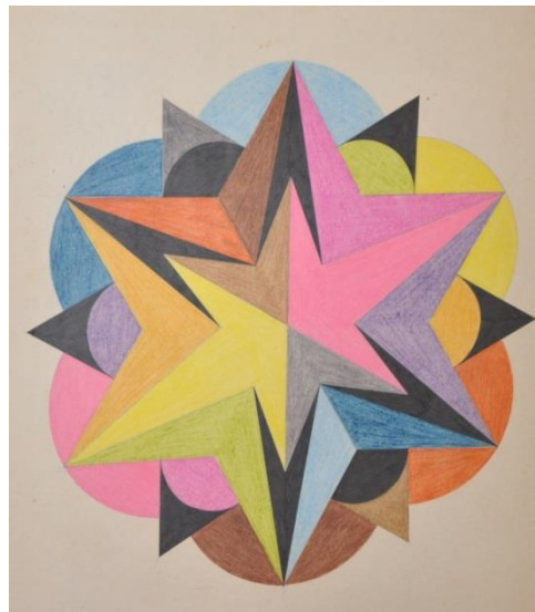
Plate III: The Blast, Jai Mariali, Coloured Pencil on Board, 2014. A Collection of the artist.

The Blast (Plate III) displays the effects of conflicts in the society, the bomb blasts which led to loss of lives and properties in the various conflicts.